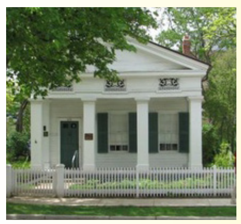
Kempf House Museum