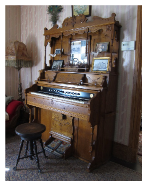
WCHS Organ at the Kempf House

Although his first commissions were for churches, his success lay in serving the public with affordable, light, reed organs which were increasingly popular after the Civil War, especially among the music-loving German population. Everyone had an organ in their parlor as a status symbol and playing the organ at family gatherings was a favorite pastime, especially for farmers. In fact, every town had an organ factory. Early records of the company show that many of their organs were sold in Macomb, Lenawee and Washtenaw counties.