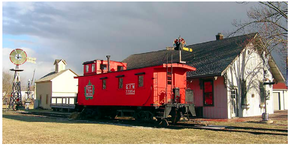
The SalineDepot Museum

The Saline Railroad Depot once had freight house, telegraph, and passenger facilities and served as a crucial link between Saline's rural territory and the outside world. While all of the original surrounding buildings have been removed, the Depot still stands on its original site. Located at 402 N. Ann Arbor Street, just north of Downtown Saline, it is now The Depot Museum and open year round on Saturdays for browsing and guided tours. Visitors will see a station agent's room, freight room, furnished caboose, and livery barn. A restored Eclipse Windmill and walking trail are also on the property. Regular hours are 11:00 AM-3:00 PM and by appointment. Groups larger than ten require a reservation. Call 734-944-0442 or view www.salinehistory.org.